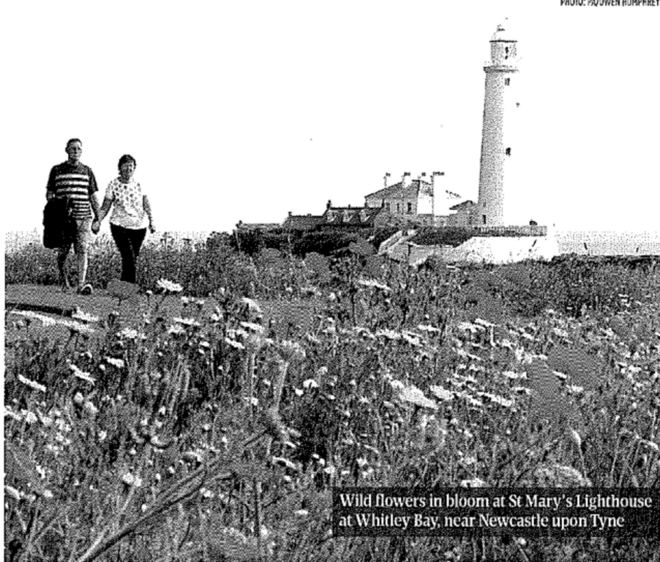
Wild flowers in bloom at St Mary's Lighthouse at Whitley Bay, near Newcastle upon Tyne

It was at the request of the local people that I, as a young priest, celebrated the Eucharist on the mountain one summer morning. The